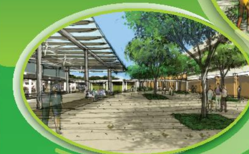
◀ Example (Heritage Garden @ Yishun)