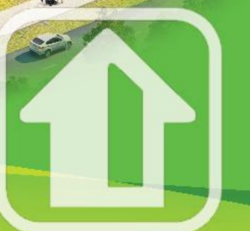
Jurong Regional Library