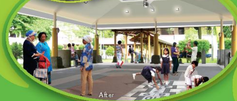
▲ Improvements to pavilion