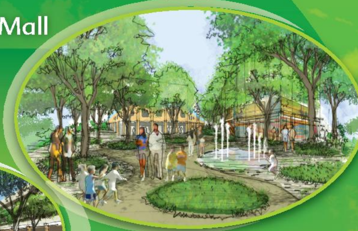
▲ Park-like setting